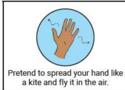
Pretend to spread your hand like a kite and fly it in the air.