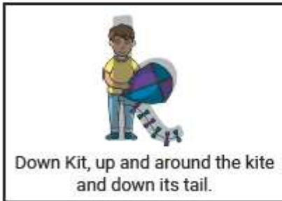
Down Kit, up and around the kite and down its tail.